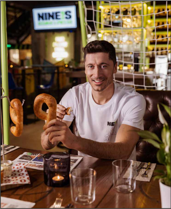
BE OUR BIGGEST FAN. Robert Lewandowski with NINE'S Team

Over 1,300 m 2 of emotions in the interior plus a garden with a fountain in the middle. 4 levels of the historic 19th-century Brewery - the heart of the Browary Warszawskie. Each zone is a different experience. A different story, but the same love for sport and food. You are in a place that is supposed to be a true Temple of Sports. We want to thank those who inspire us for their commitment, persistence and motivation. Regardless of whether you win or lose, remember that the perfect motivation on the way to your goal are other people - those who achieve these goals. We invite you to join our team and create a unique place full of great emotions - not only those on the pitch. Let NINE'S be the beginning of our joint adventure in the spirit of sport and fair play.